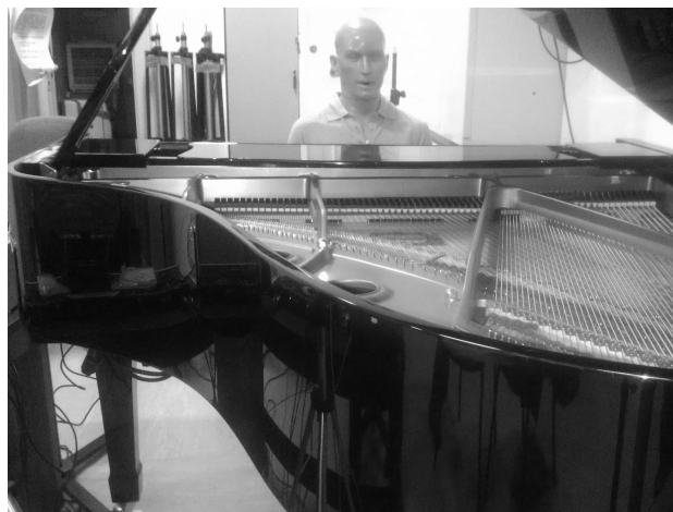
Figure 1: Setup for loudness estimation on the grand piano (PD) using a KEMAR mannequin.

The experiment made use of two Yamaha Disklavier pianos, a grand model DC3 M4 (setup in Padova, "PD" hereafter) and an upright model DU1A with control unit DKC-850 (setup in Zurich, "ZH" hereafter), offering a switchable "quiet mode" that allows their use as silent MIDI keyboards. In this configuration the hammers are prevented from hitting the strings, and therefore the piano does not resound nor vibrate, while the keyboard mechanics is left