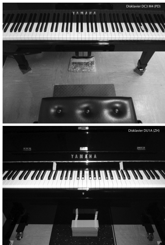
Figure 2: Disklavier setups. Top: Yamaha DC3 M4 (PD). Bottom Yamaha DU1A (ZH).

control with the help of a software developed in the Pure Data environment. The program allowed to read playlists describing the series of randomized trials (e.g. A4, vibration OFF), and record answers for each subject. The quiet mode of the Disklavier pianos was remotely switched at need via automatic software control. At each trial, a correctness test was performed to check on the played note and velocity (see Section 3 for more details).